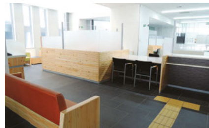
Takatsuki Branch (Newly Built in July 2015)

In December 2015, the Bank of Kyoto received an “Honorable Mention” in the Japan Wood Design Award 2015 sponsored by the Forestry Agency. To date, 32 of our branch offices have incorporated locally grown wood in their interior designs. Some of our branches, such as the Kinkakuji Branch and the Takatsuki Branch, use wood thinned out from the Kyogin Fureai Forest, a forest that the Bank preserves.